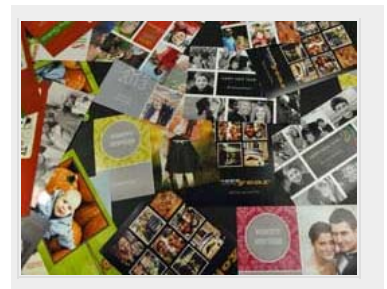
Cards and other custom stationery was a hot topic at the conference.

'These included the high end B2B and custom card stationery facilities, for example.'